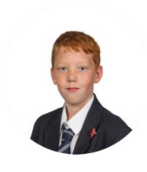
SPARX Reader leaderboard: